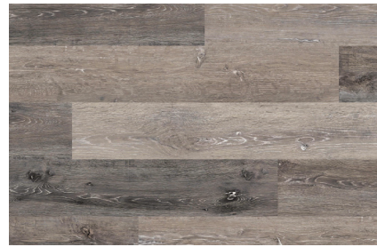
1201 HONEY OAK

Real Appeal planks are available in 6" x 48" planks