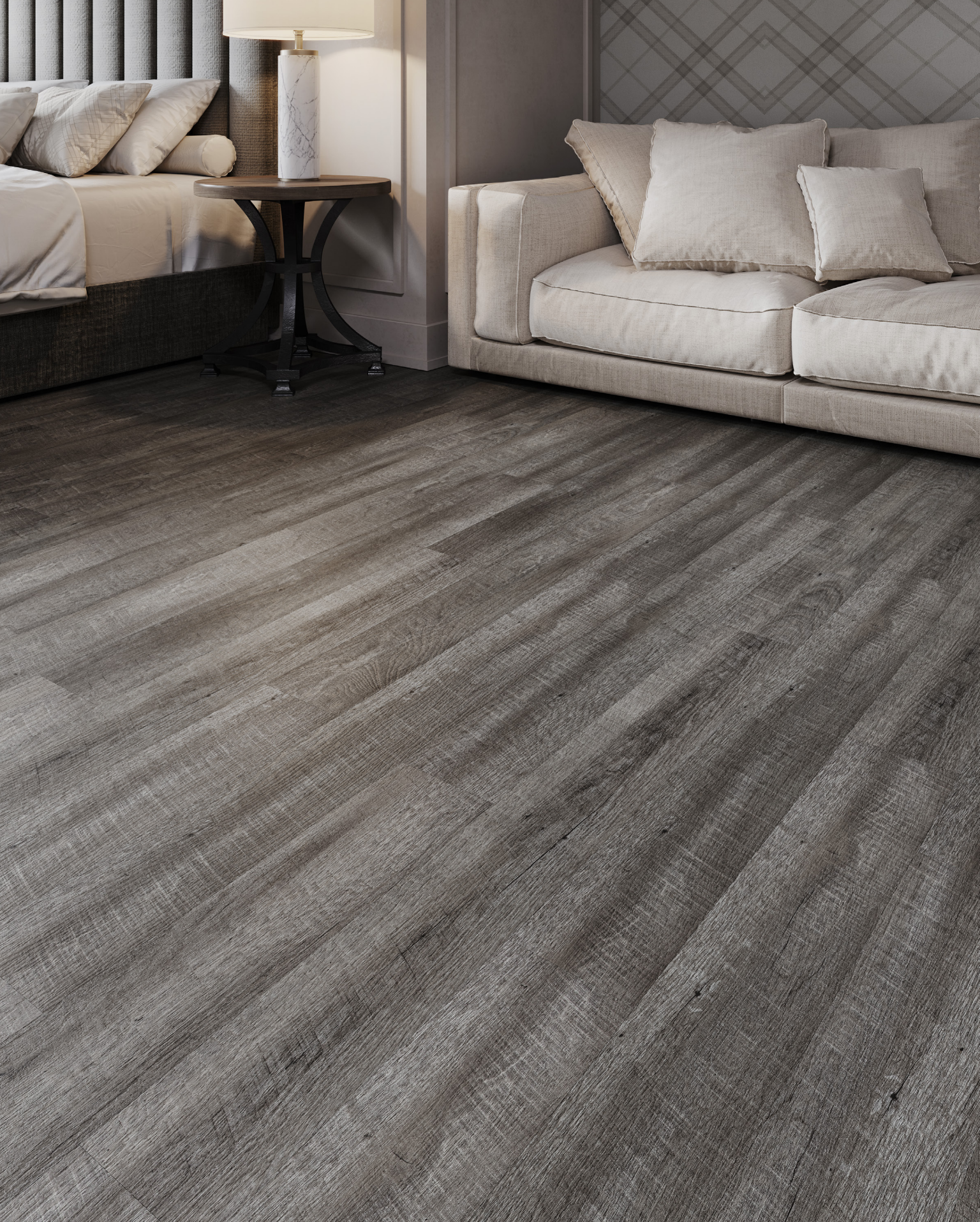
REAL APPEAL | 7502 SAWMILL GRAY