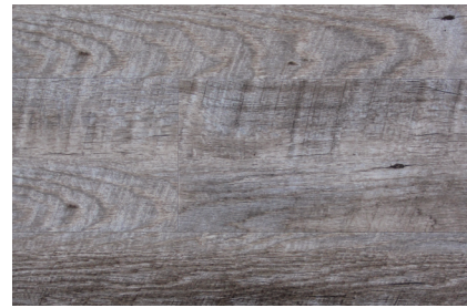
7502 SAWMILL GRAY