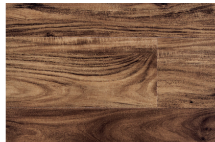
1706 ANTIQUE TIMBERS