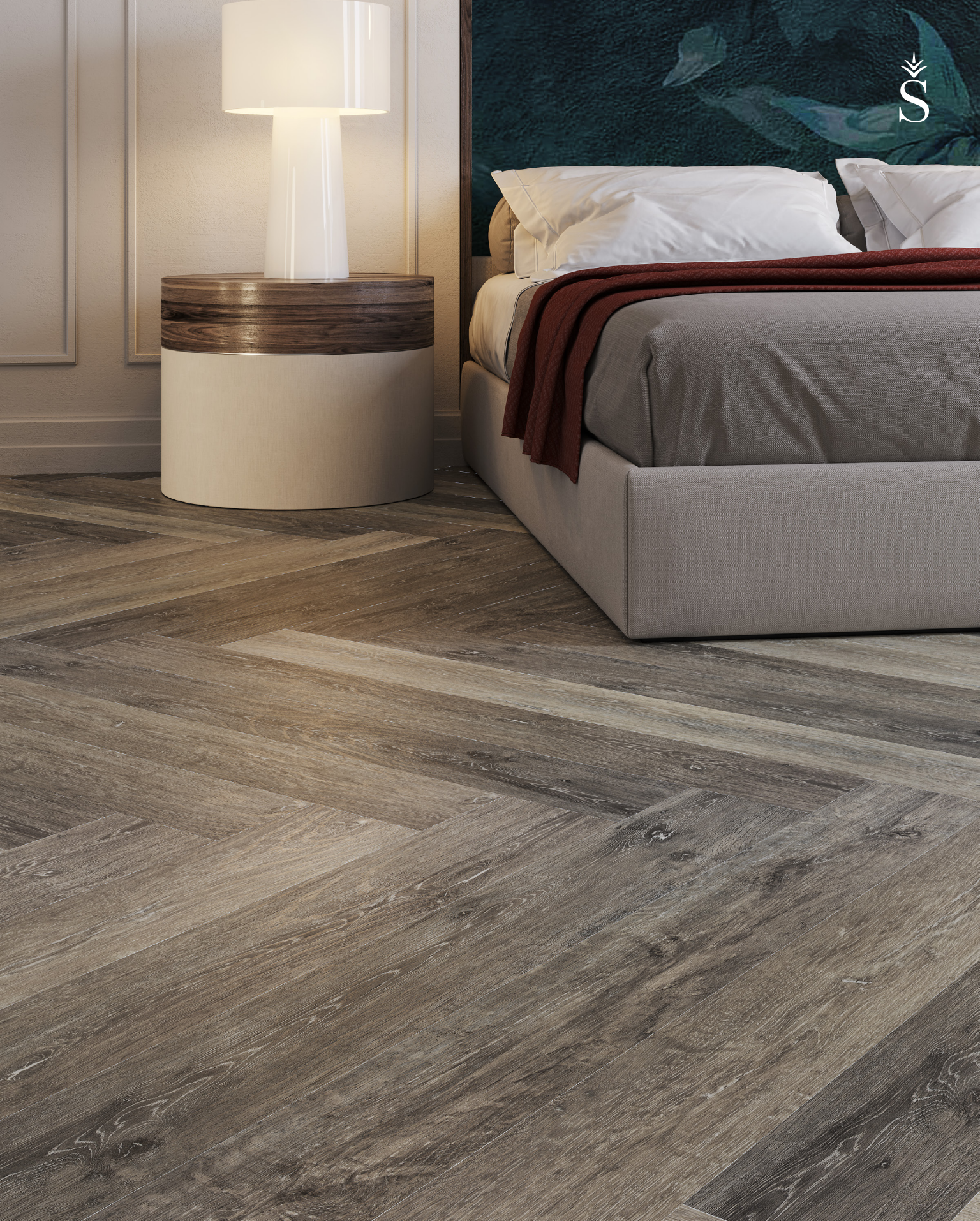
REAL APPEAL | 1201 HONEY OAK