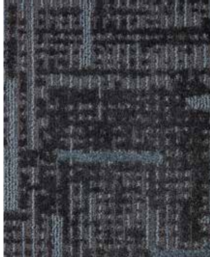
7604 CITY LIGHTS