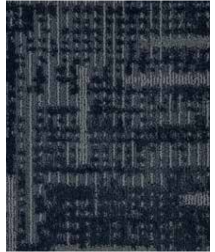
4801 ZOOT SUIT