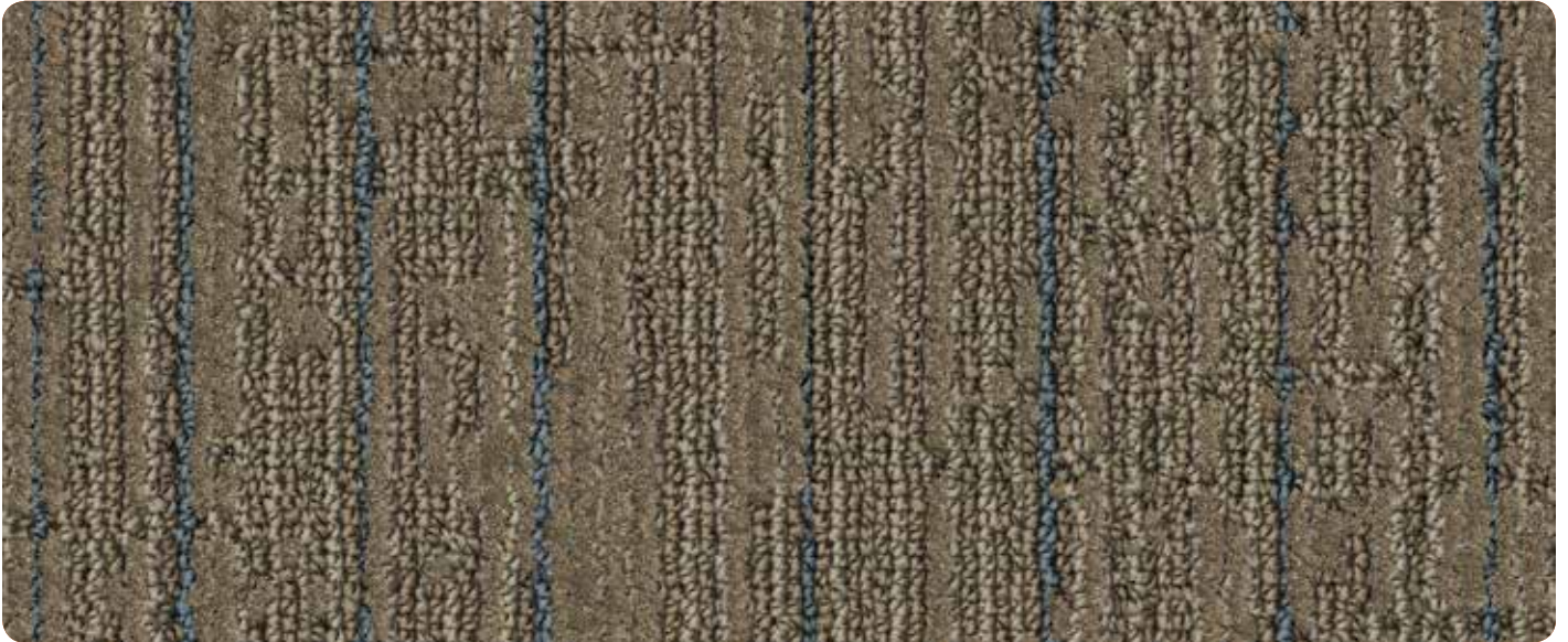
A) 3250 B) 3249 C) 3507