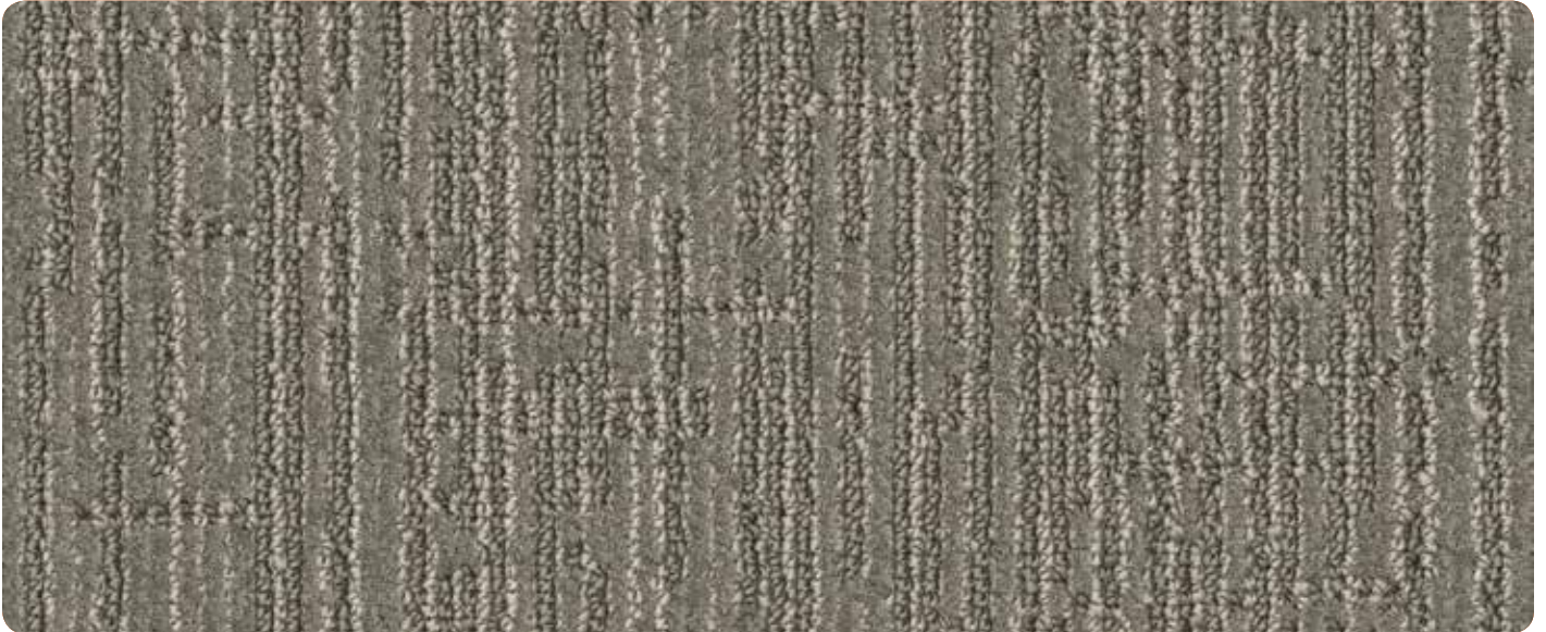
A) 3188 B) 3140 C) 3007