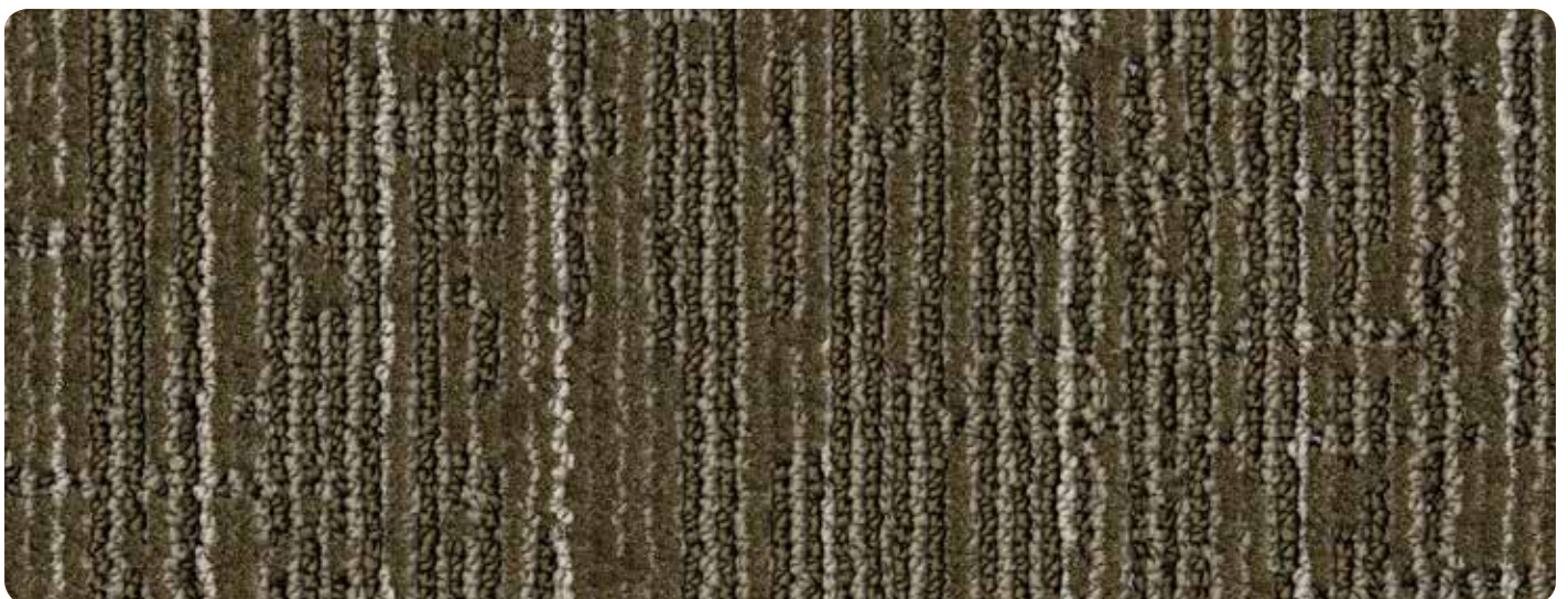
A) 3213 B) 3236 C) 3140