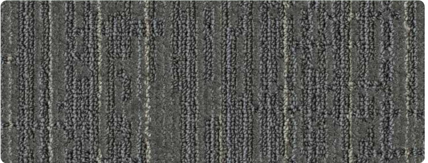
A) 3193 B) 185.464 C) 3197