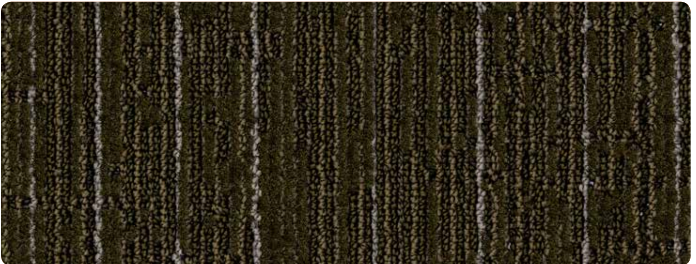
A) 3299 B) 3213 C) 3126