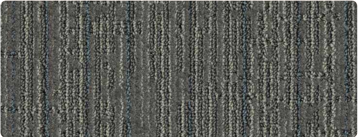
A) 3197 B) 3464 C) 3507