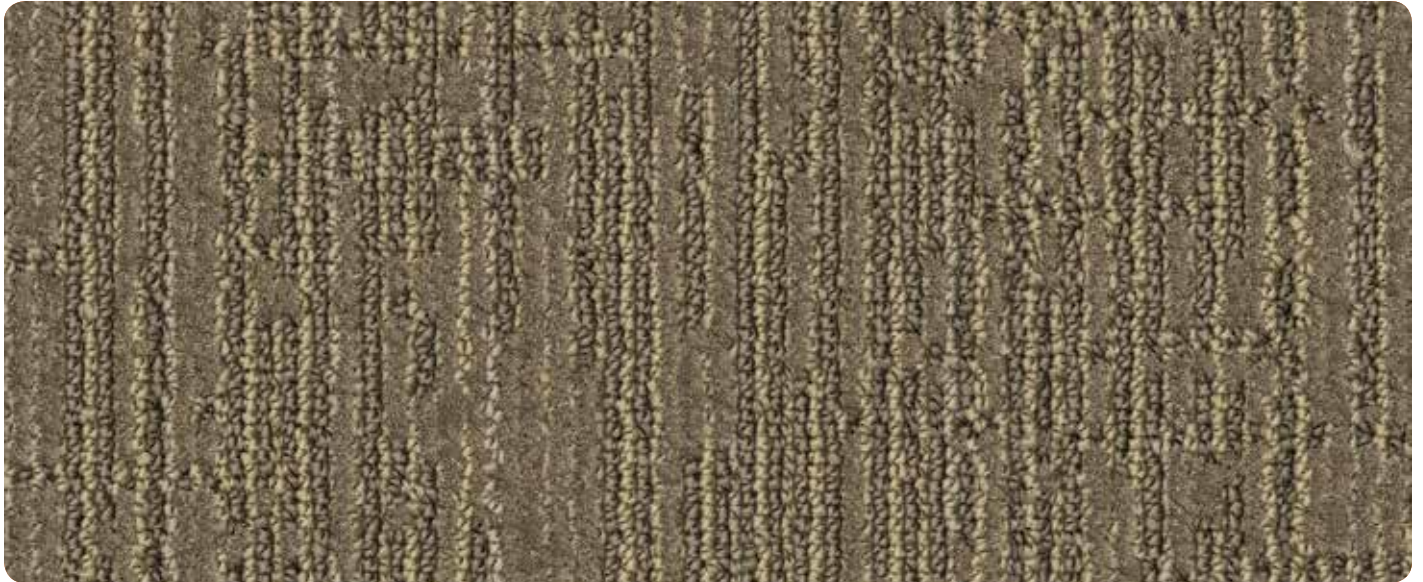
A) 3250 B) 3723 C) 3205