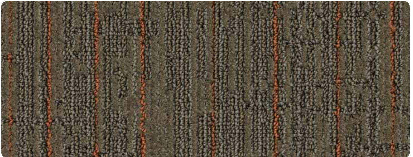
A) 3204 B) 3201 C) 3216