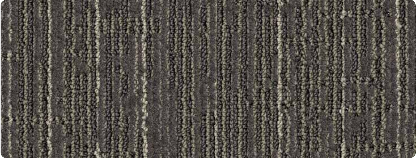
A) 3143 B) 3188 C) 3140