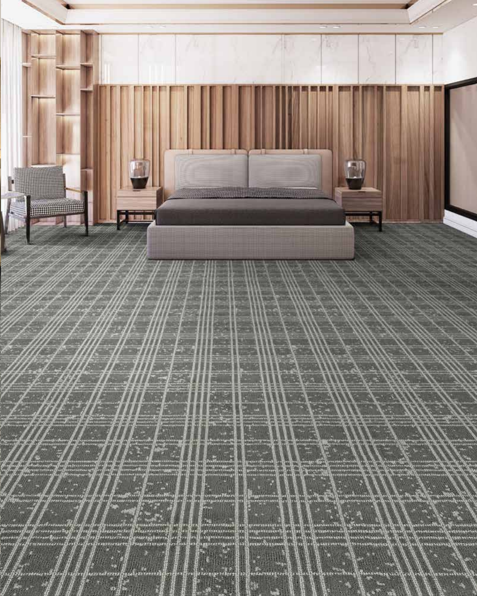
MODERN STYLE | B7037 FALCO | 8305 ASHER