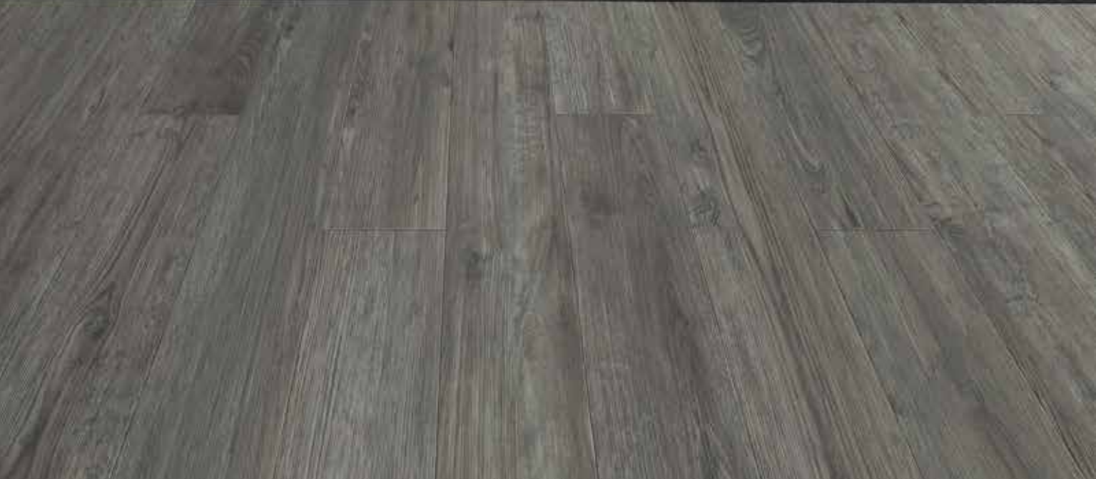
MODERN STYLE RUG | B7041 NEO | 4501 HUDSON | NATURE CRAFT LVT | CLASSIC GRAY 8307