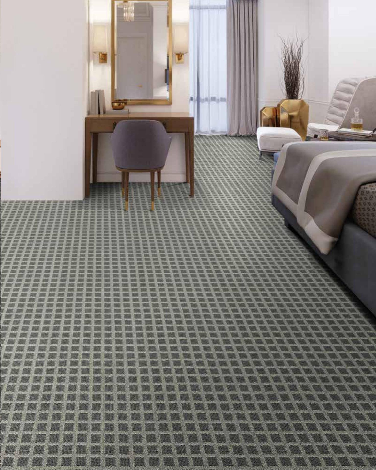
MODERN STYLE | B7035 WICK | 8305 ASHER