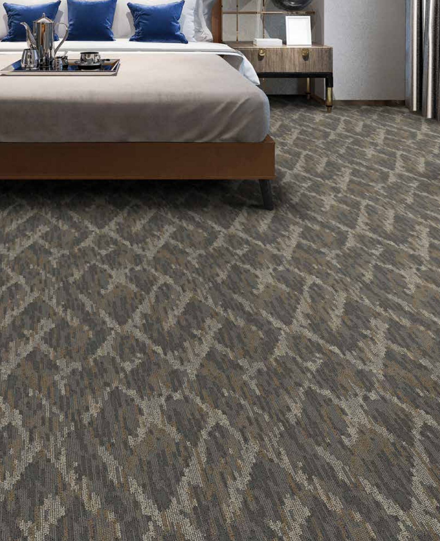
HC029 BROADLOOM 12' W | PATTERN REPEAT 24" W X 36" L