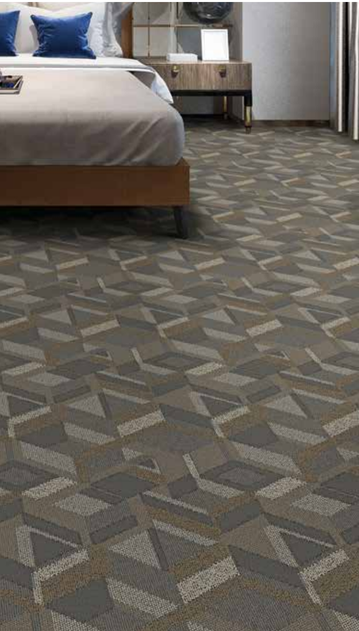
CUSTOM PATTERN OPTION HC023

Signature is known for its dedication to helping customers achieve their unique vision for senior living and hospitality environments. We understand that you are incredibly busy and constantly have tight project timelines. So we offer a customization process that is fast, easy and doesn't require you to compromise your design vision to meet your deadlines.