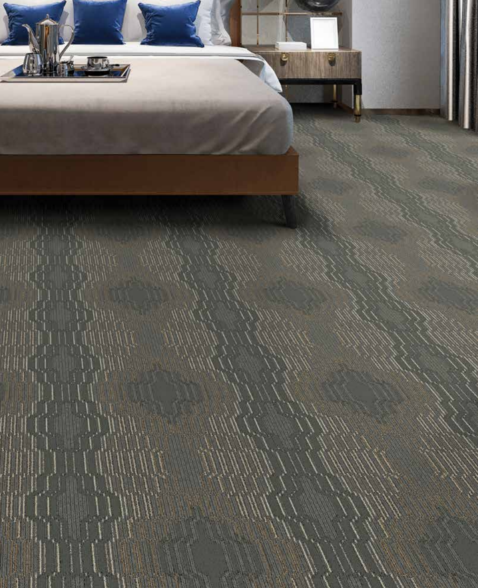
HC025 BROADLOOM 12' W | PATTERN REPEAT 24" W X 27" L