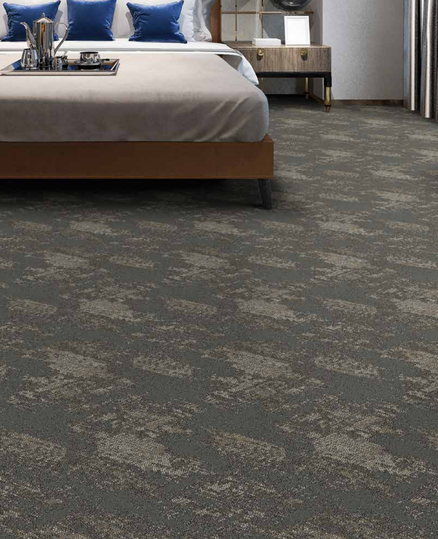
HC027 BROADLOOM 12' W | PATTERN REPEAT 24" W X 32" L