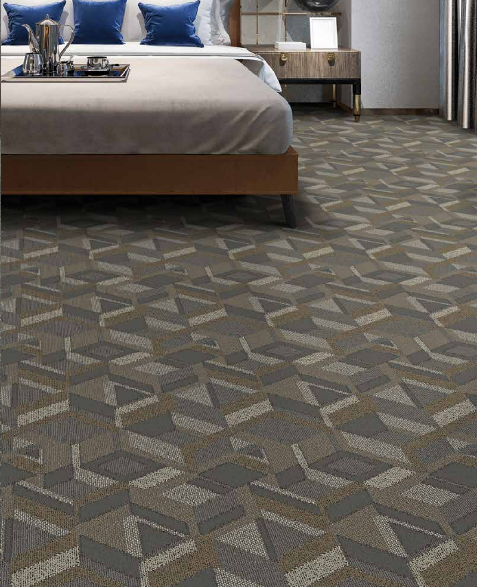
HC023 BROADLOOM 12' W | PATTERN REPEAT 24" W X 24" L