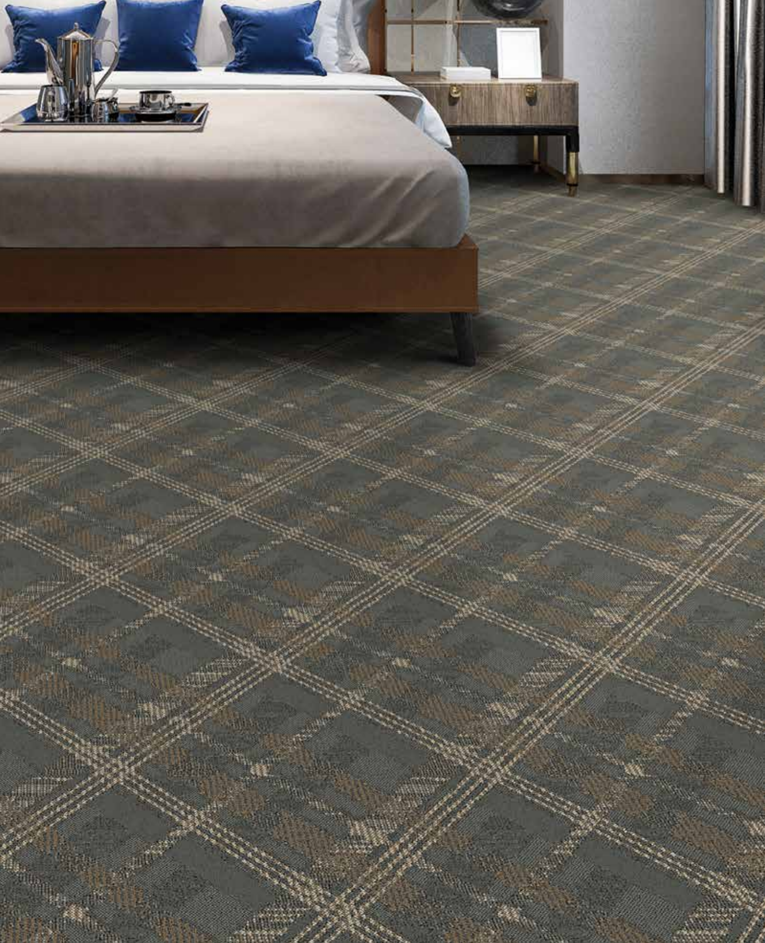
HC021 BROADLOOM 12' W | PATTERN REPEAT 24" W X 24" L