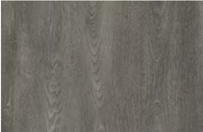
L1009 LOOSE LAY V2 L1011 SPC 855 MEMPHIS

Variability (V) indicates the degree of color, shade or pattern variance in a particular style. The rating system is least (V1) to most (V4) varying from piece to piece. Multiple planks may need to be ordered for visual confirmation. Urban Escapes is a (V2) variability.