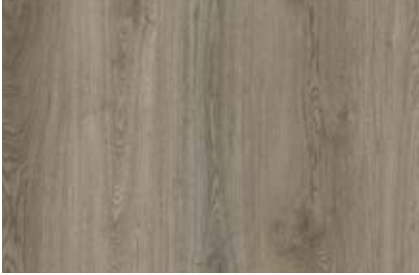
L1009 LOOSE LAY V2 L1011 SPC 402 AUSTIN