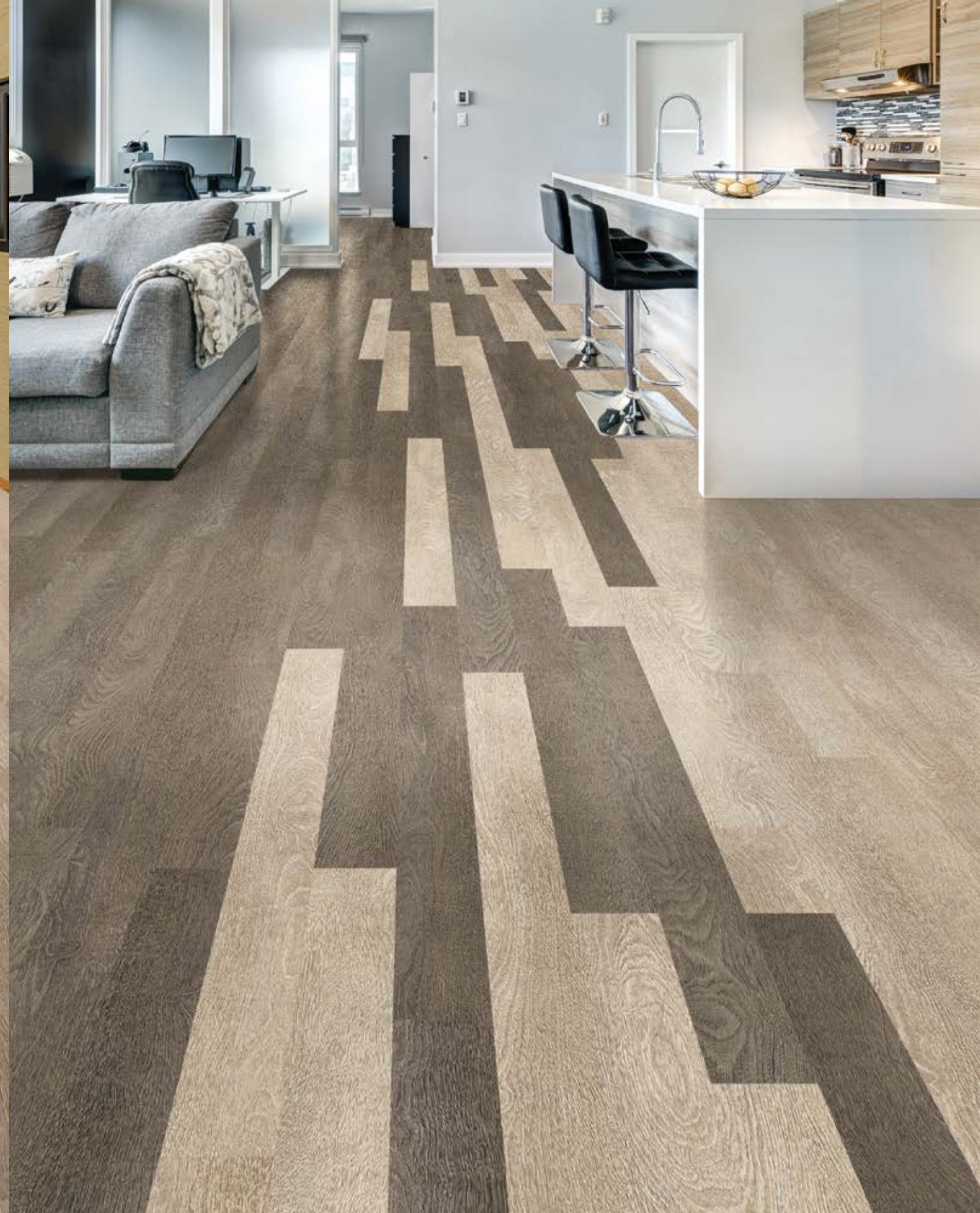
URBAN ESCAPES (L1009 LOOSE LAY OR L1011 SPC) | 721 NASHVILLE | EMERGE COLLECTION CARPET TILE | CT0121 | 24" X 24"