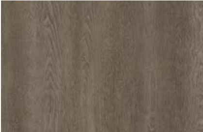
L1009 LOOSE LAY V2 L1011 SPC 776 SAVANNAH