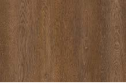
L1009 LOOSE LAY V2 L1011 SPC 173 JUNEAU

Urban Escapes is available in 7" x 48" plank size.