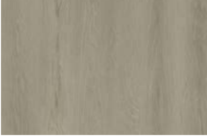
L1009 LOOSE LAY V2 L1011 SPC 714 SEATTLE