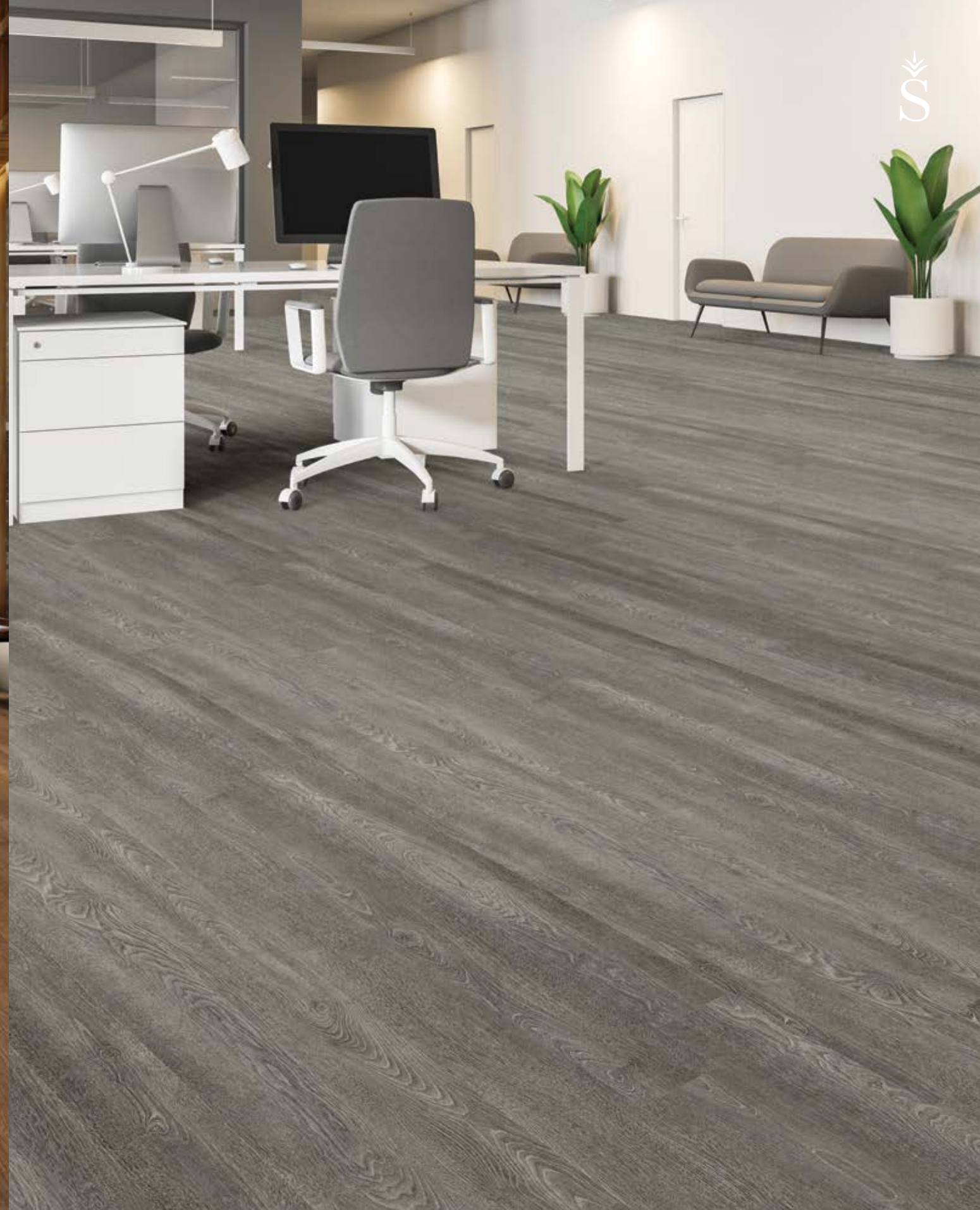
URBAN ESCAPES (L1009 LOOSE LAY OR L1011 SPC) | 855 MEMPHIS