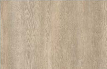
L1009 LOOSE LAY V2 L1011 SPC 721 NASHVILLE