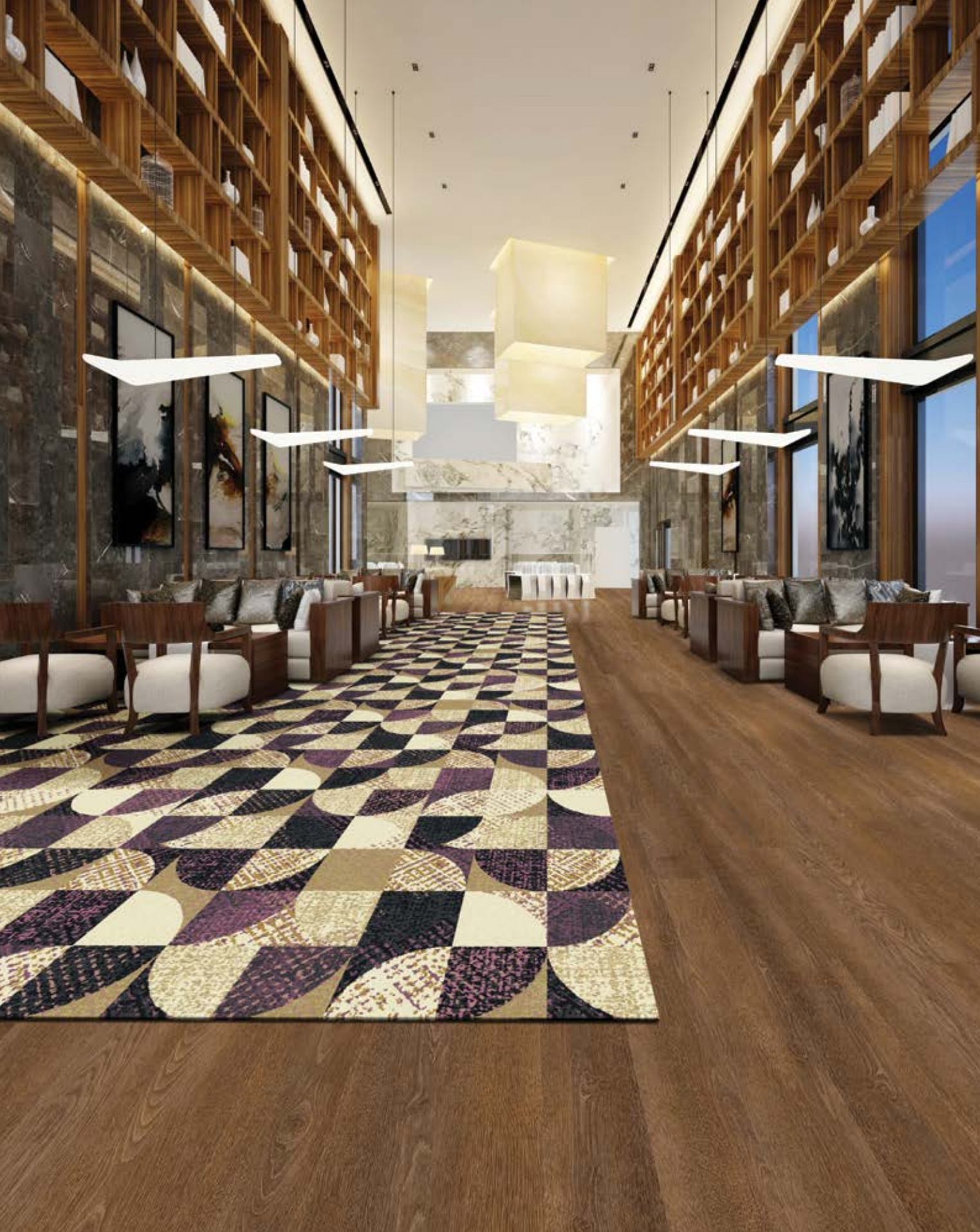
URBAN ESCAPES (L1009 LOOSE LAY OR L1011 SPC) | 173 JUNEAU | LIVING SKETCHES BROADLOOM | HC138