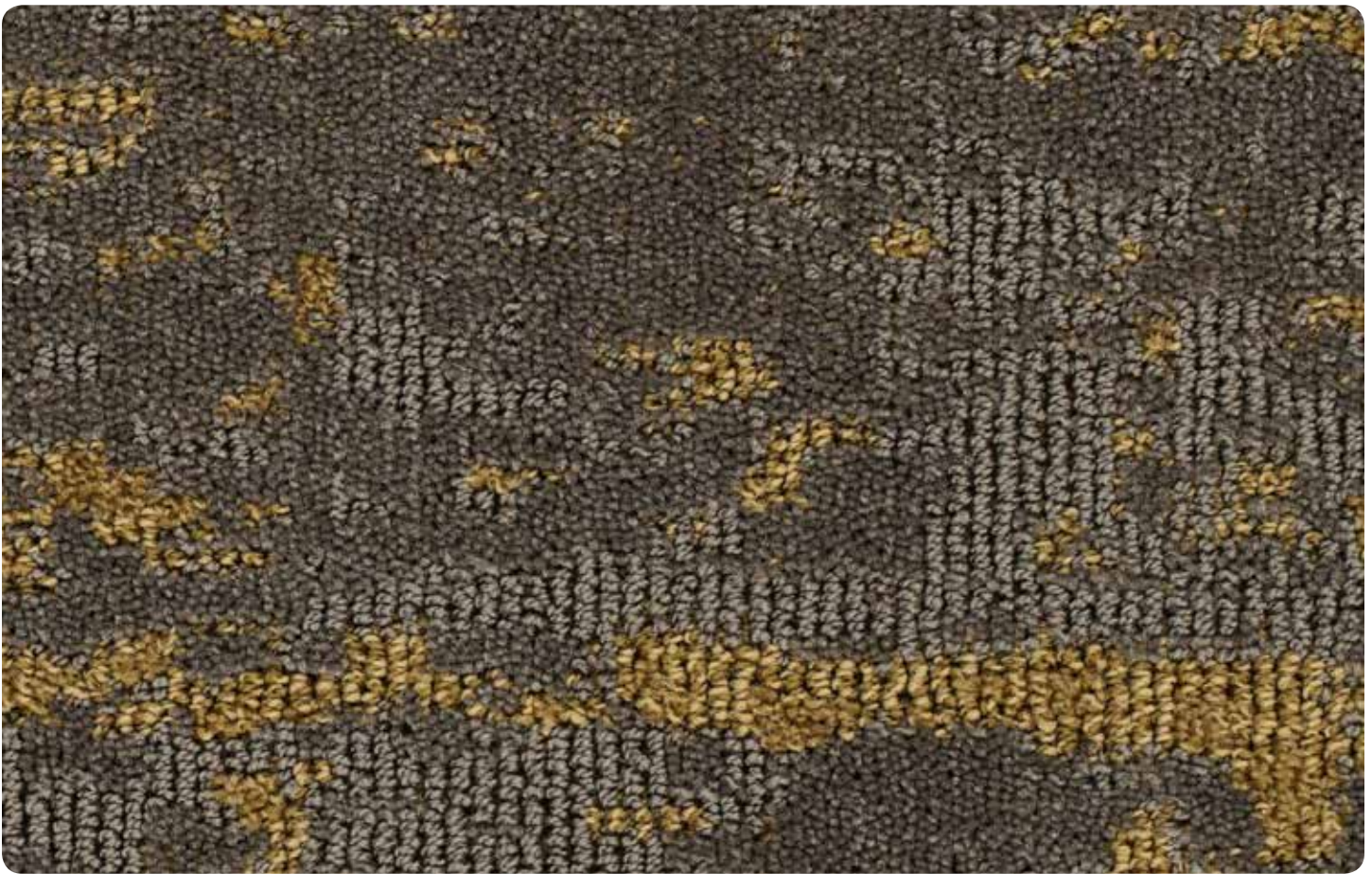
A) 408.700 B) 3126