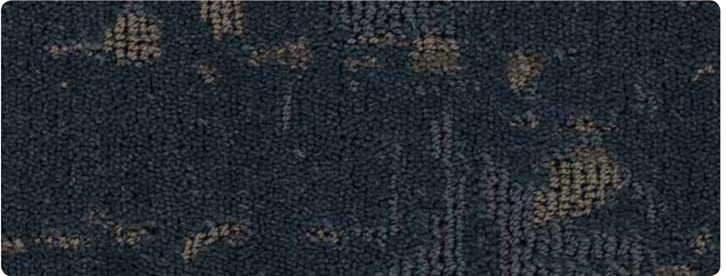
A) 3143 B) 3123