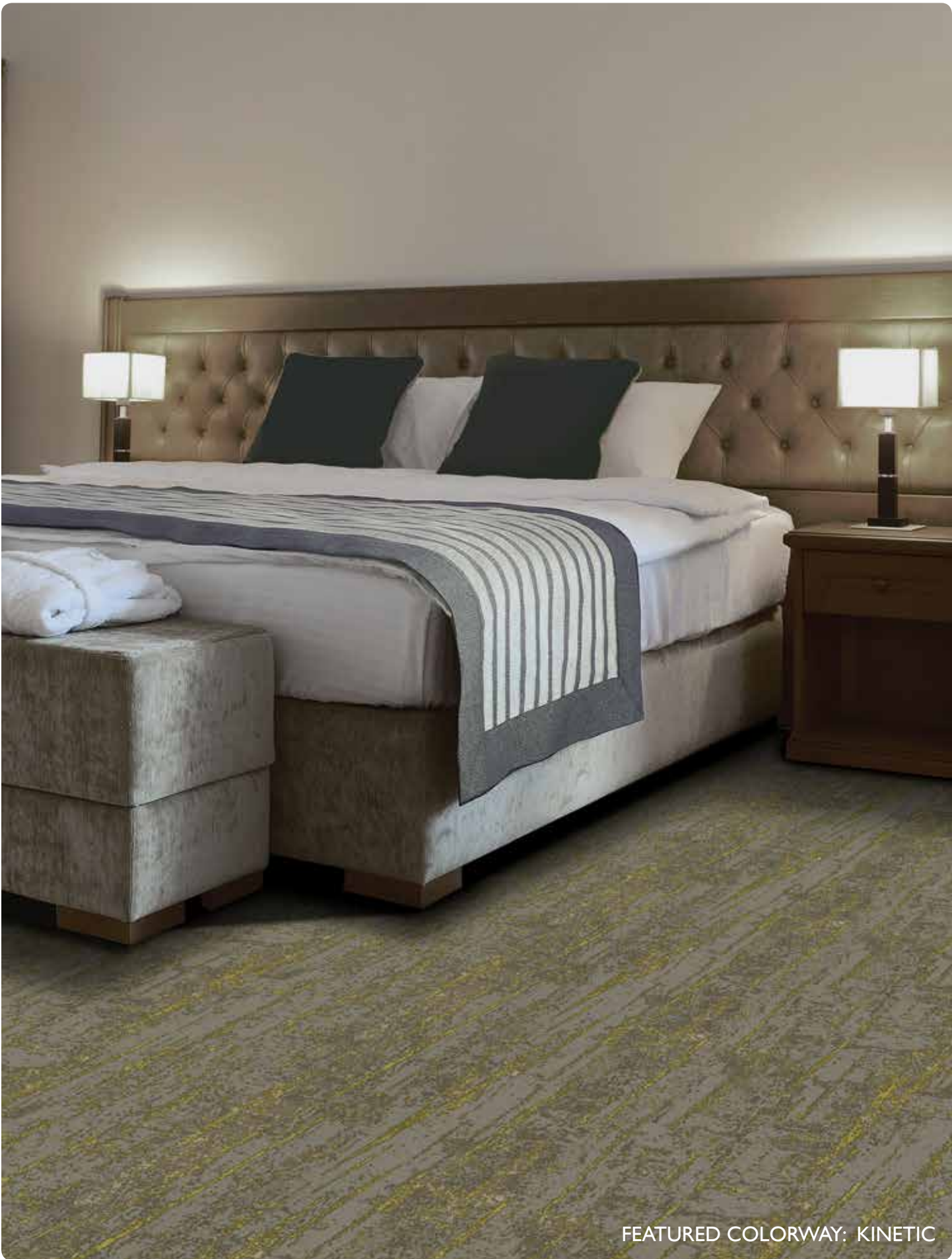
FEATURED COLORWAY: KINETIC