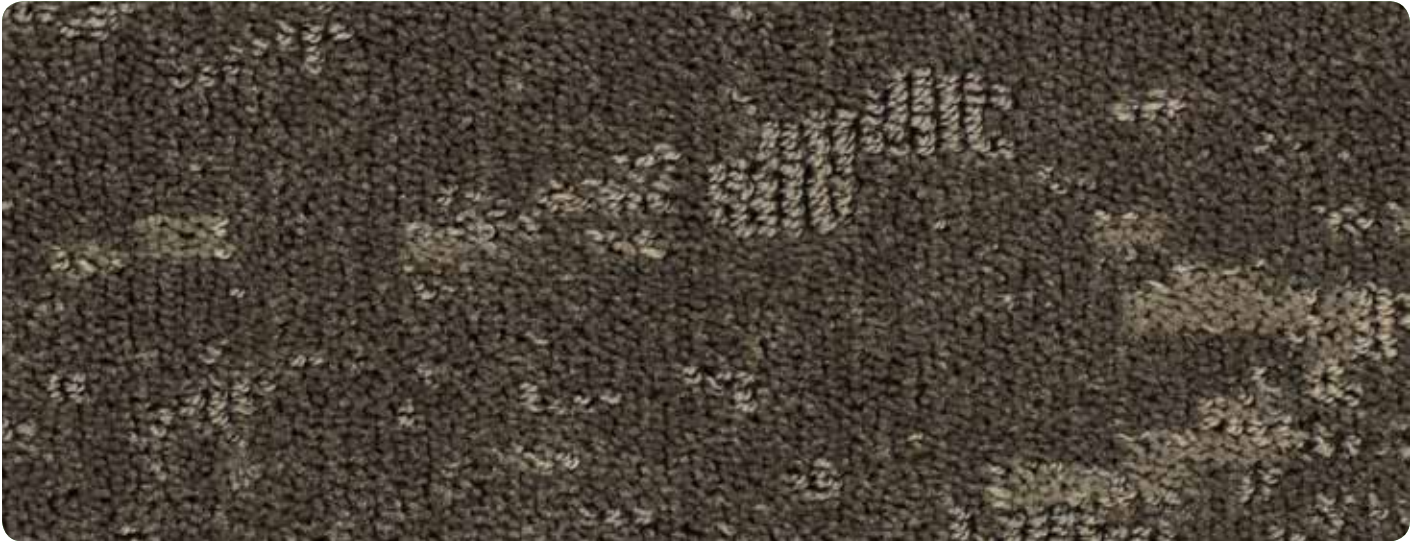
A) 3201 B) 3126