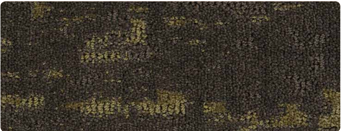
A) 3412 B) 3238