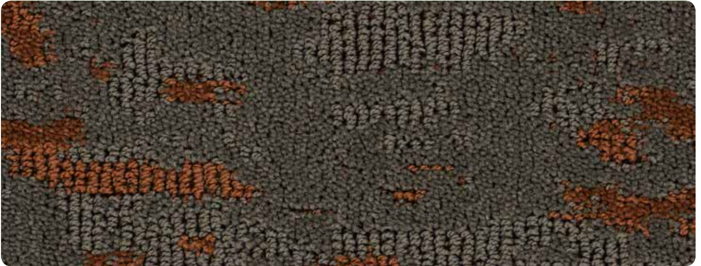
A) 3220 B) 3143