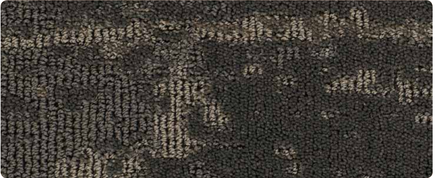
A) 3126 B) 3112