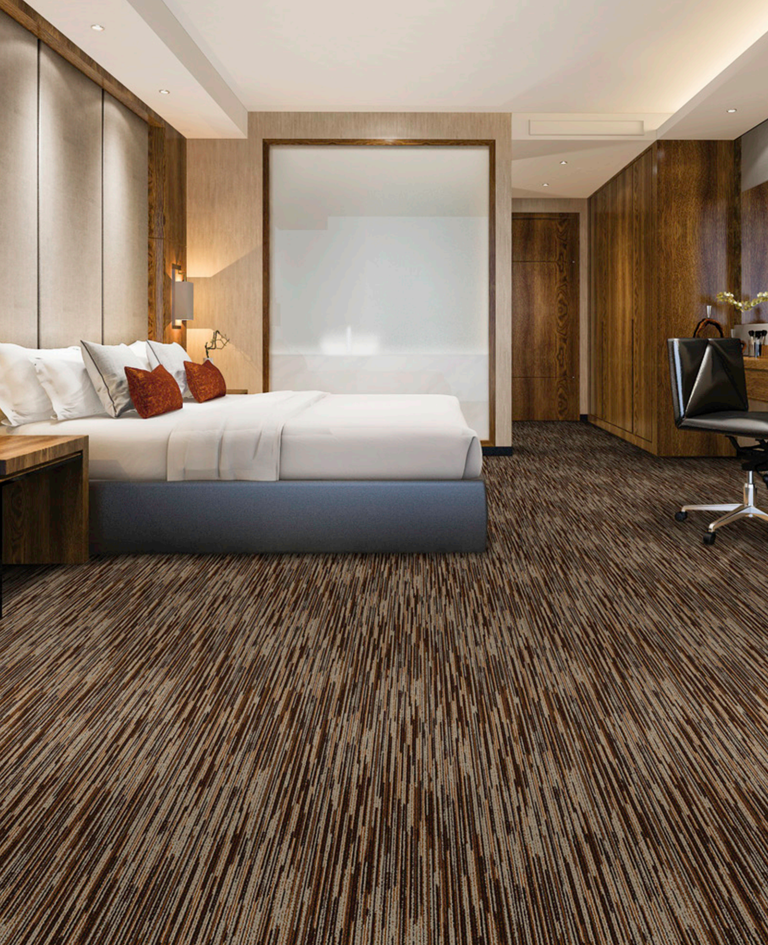
WHISPER SG038 | 1803 RUMOR | BROADLOOM 12' W OR 15'W | PATTERN REPEAT 36" W X 36" L