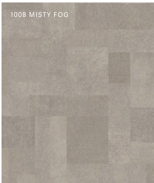
1008 MISTY FOG