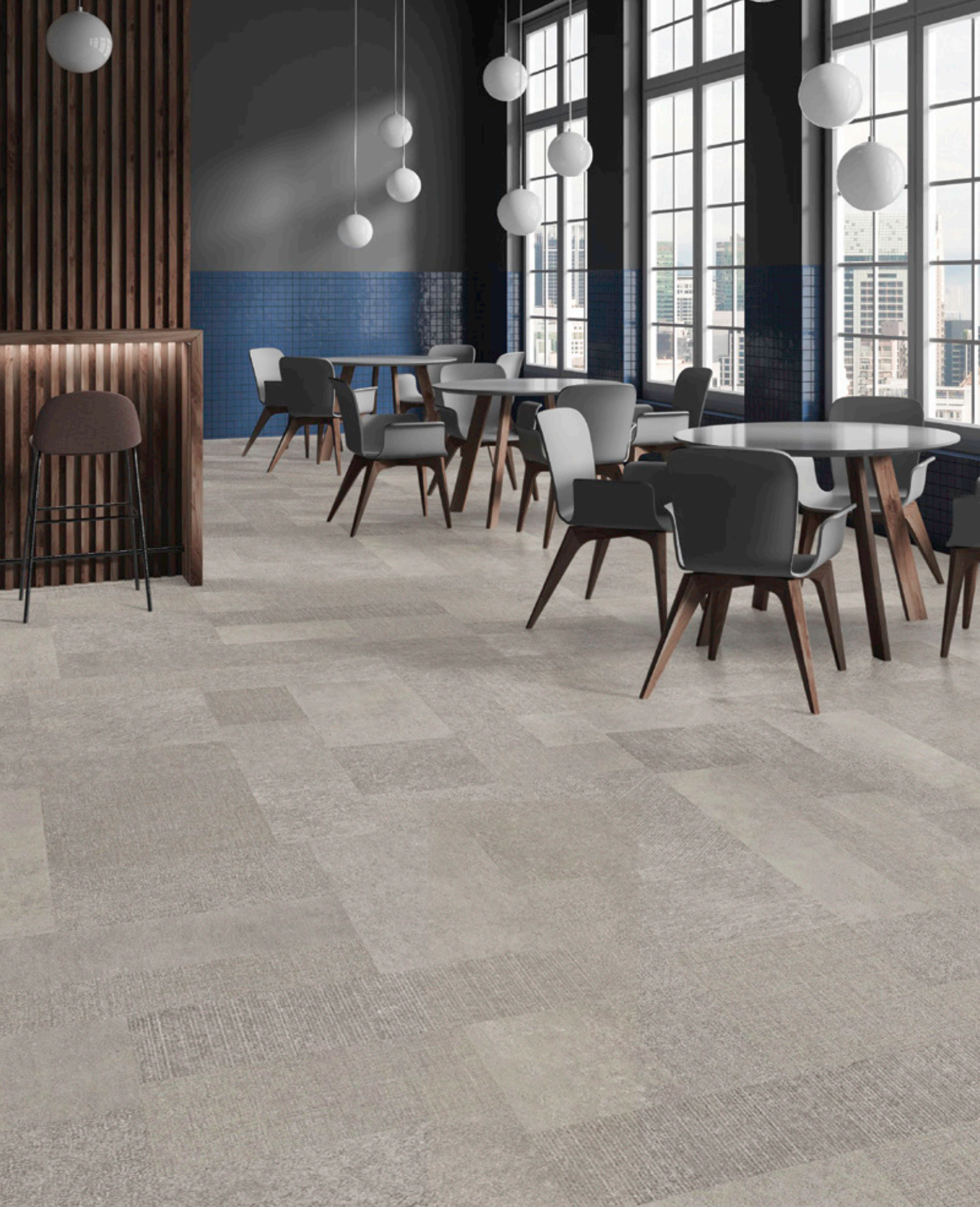
NATURE'S FUSION STONESET | 1008 MISTY FOG | 18"W X 36"L TILE | ASHLAR HORIZONTAL