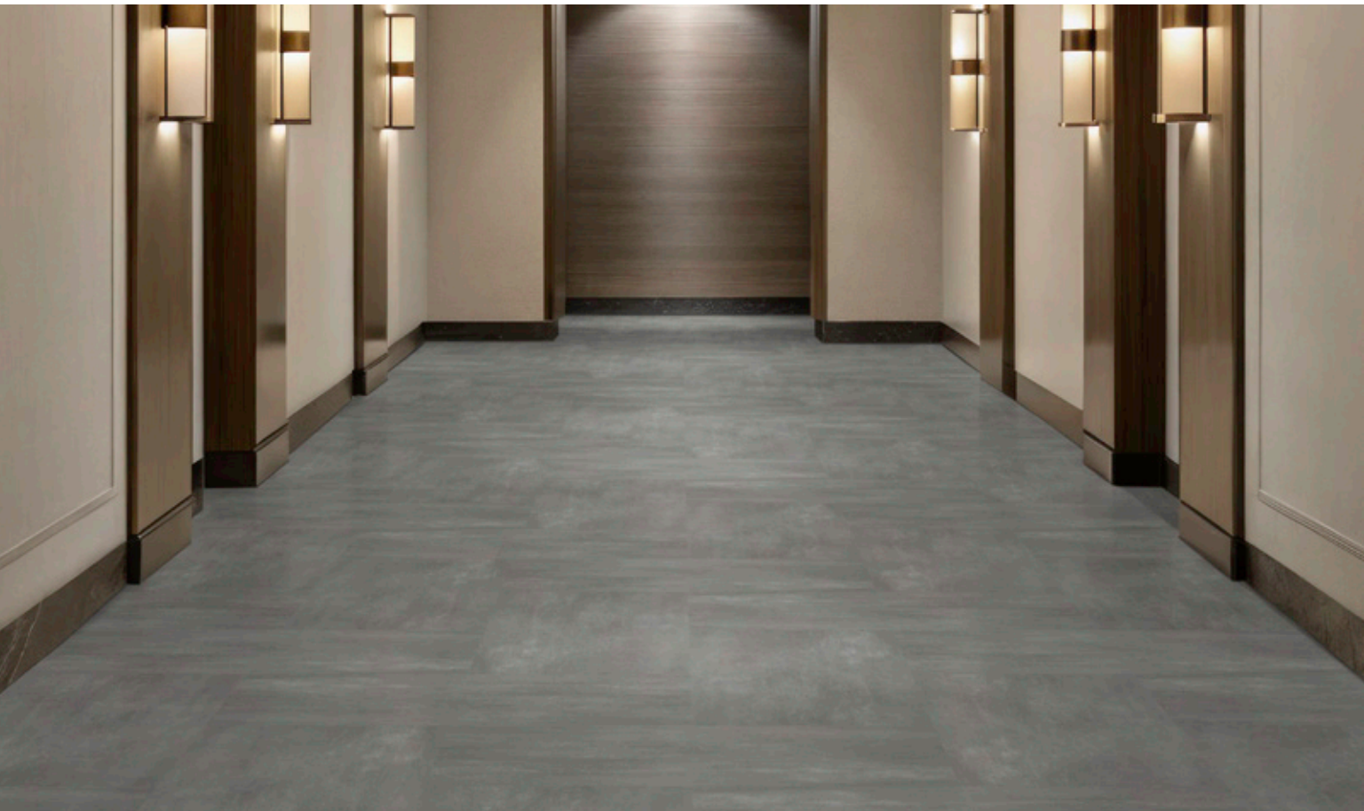
NATURE'S FUSION STONESET | 2543 STEEL | 18"W X 36"L TILE | HERRINGBONE