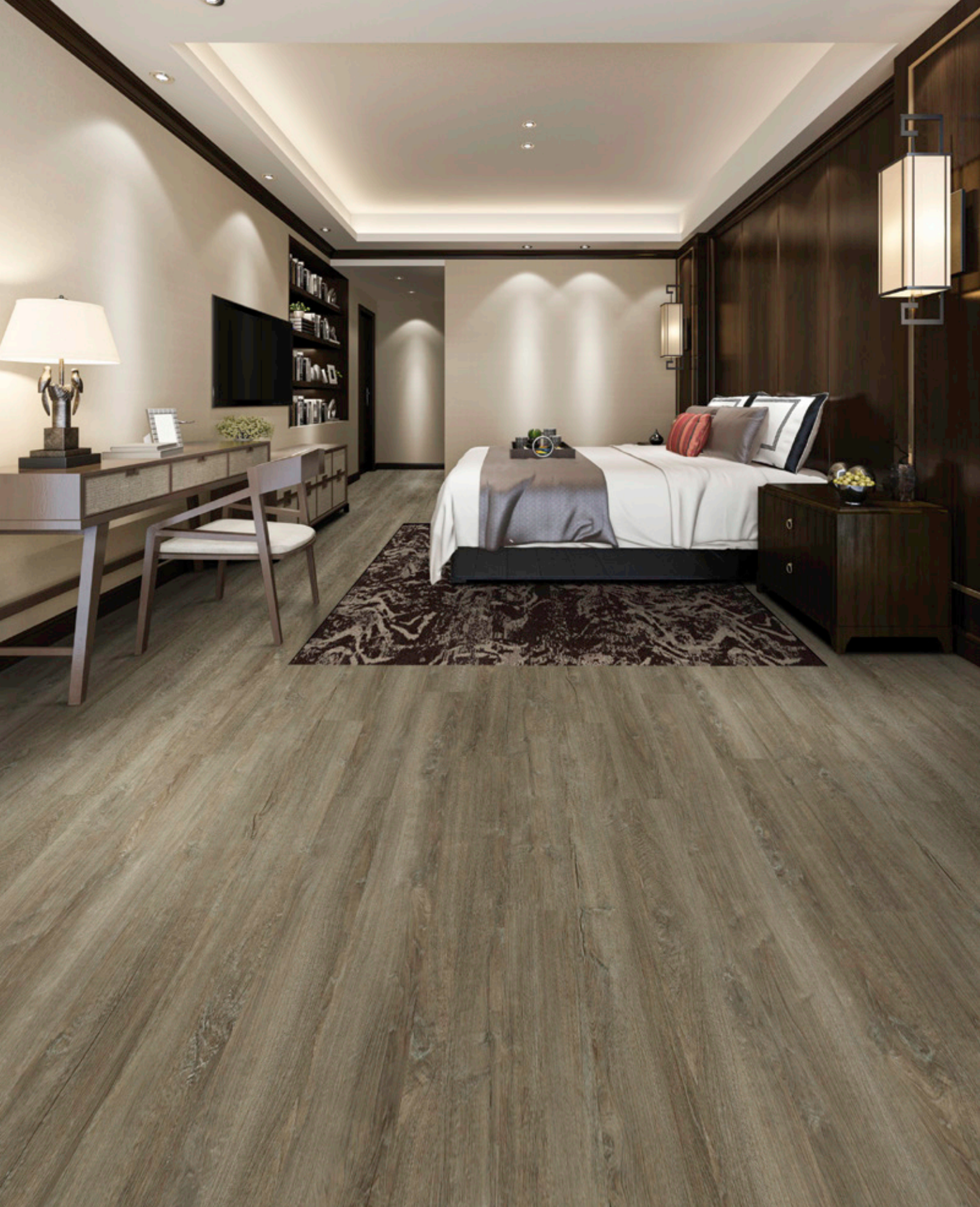
NATURE'S FUSION GRAINLINE | 266 WEATHERED TWIG | 9.25"W X 59.25"L PLANK RENDEZVOUS LANDSCAPE | ATMOSPHERE SG001 | 1806 EARTH | ASHLAR VERTICAL