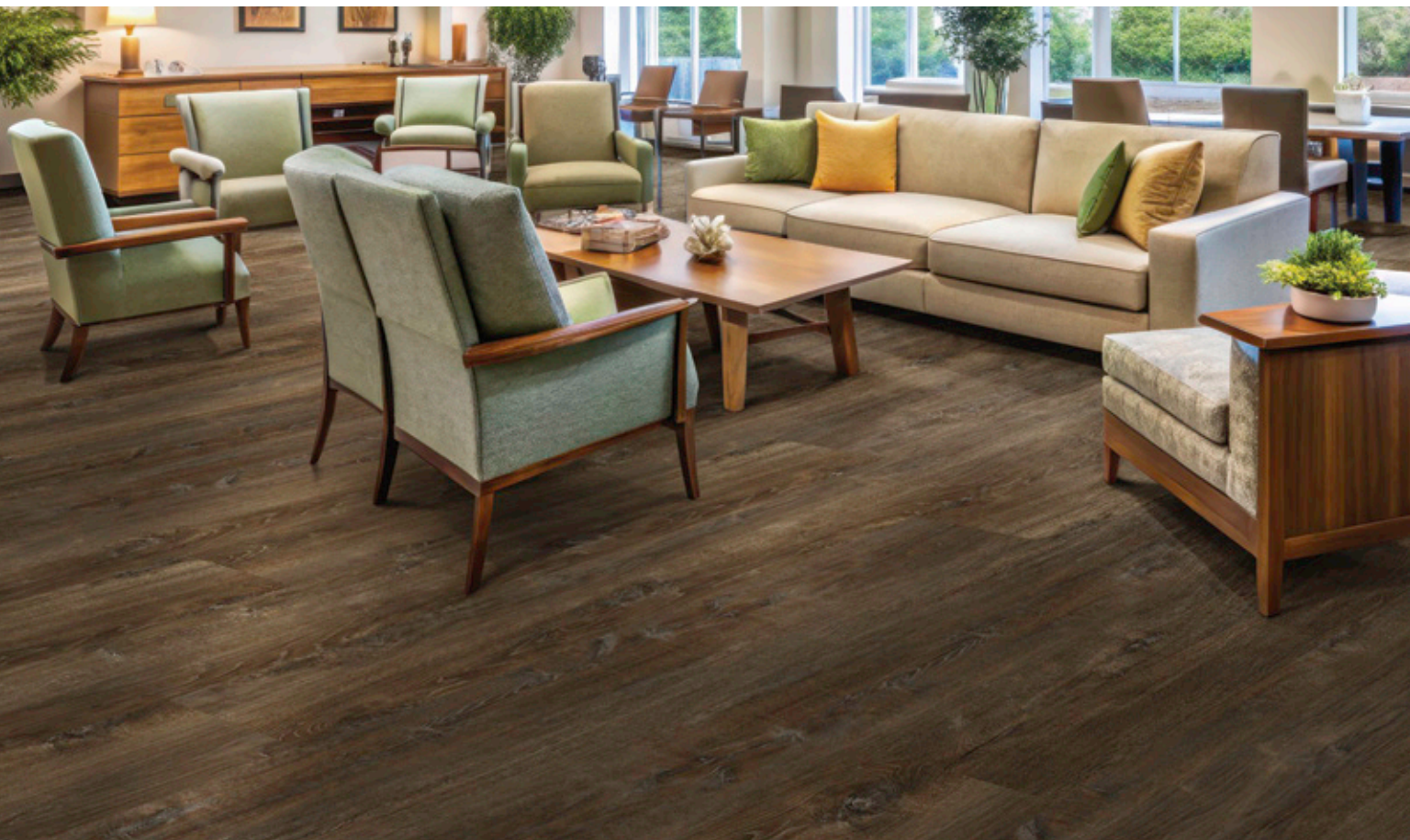
NATURE'S FUSION GRAINLINE | 135 ESPRESSO | 9.25"W X 59.25"L PLANK