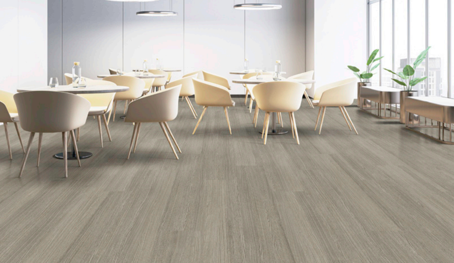
NATURE'S FUSION GRAINLINE | 171 WARM ASH | 9.25"W X 59.25"L PLANK