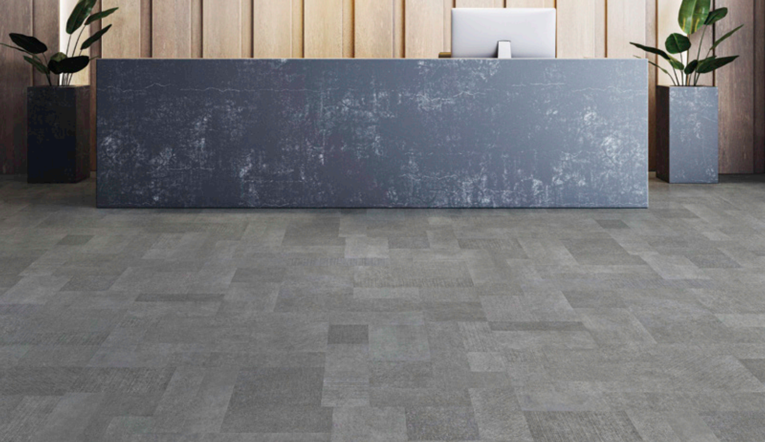
NATURE'S FUSION STONESET | 1009 FLINT | 18"W X 36"L TILE | ASHLAR HORIZONTAL